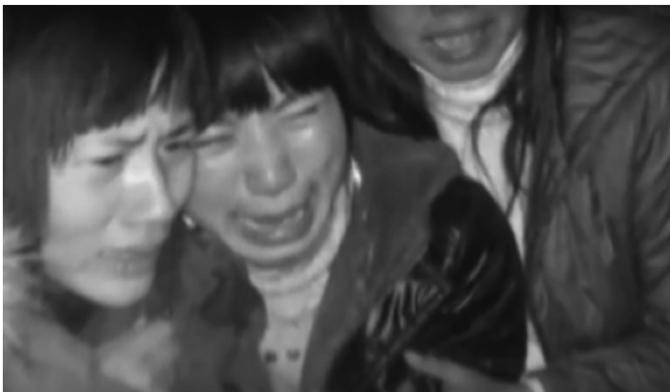
Women's Rights Without Frontiers has documented the tragic results of China's one-child policy; above, women mourn the death of their friend who died during a forced abortion.