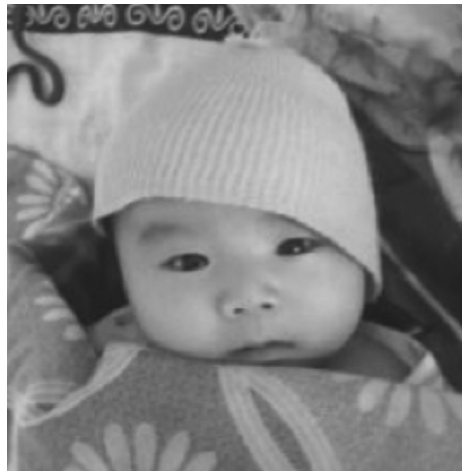
This little baby girl was rescued by Women’s Rights Without Frontiers’ Save the Babies campaign in China.

“Finally, they just picked her up—literally—she was a small woman, dragged her out of her home, screaming and crying, held her down to an operating table, cut her open and tied her tubes, all without anesthesia. She said that the pain was unimaginable—like somebody had a blow torch inside of her.