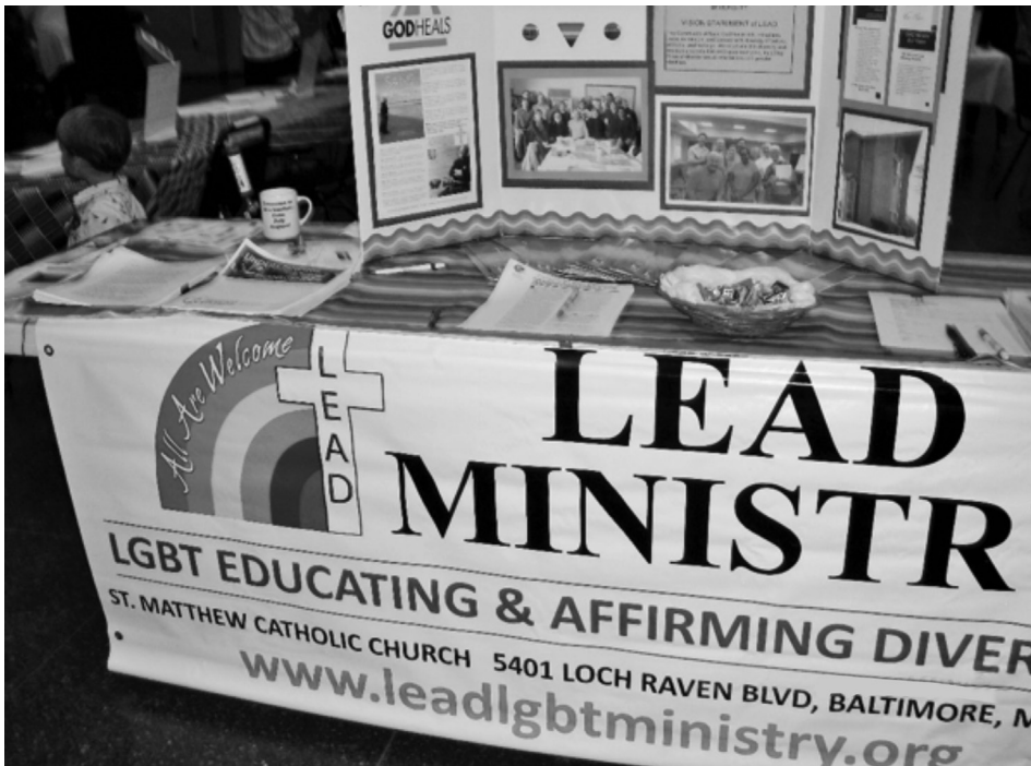
The LEAD Ministry booth at St. Matthew Church Ministry Fair offers brochures condoning and affirming homosexual behavior.

The handout (and "Solidarity Sunday") are creations of DignityUSA, a homosexual advocacy group that explicitly condones homosexual sexual acts.