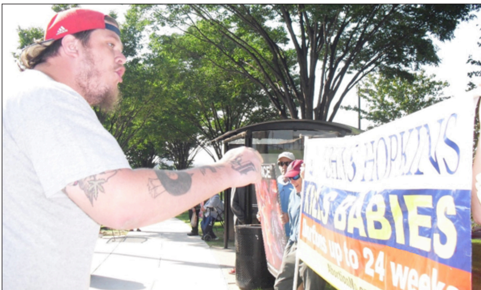
An angry passerby yells profanities at a sign holder at Defend Life's September 19 protest of abortions at Johns Hopkins Bayview.

Defend Life conducts protests against abortion at Johns Hopkins Bayview in Baltimore on the third Wednesday of each month.