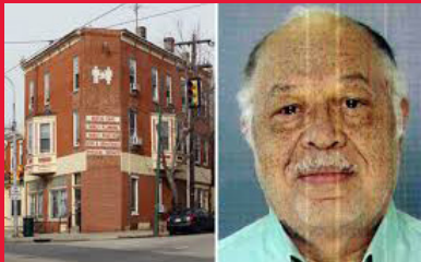
Raid on Gosnell's House of Horrors