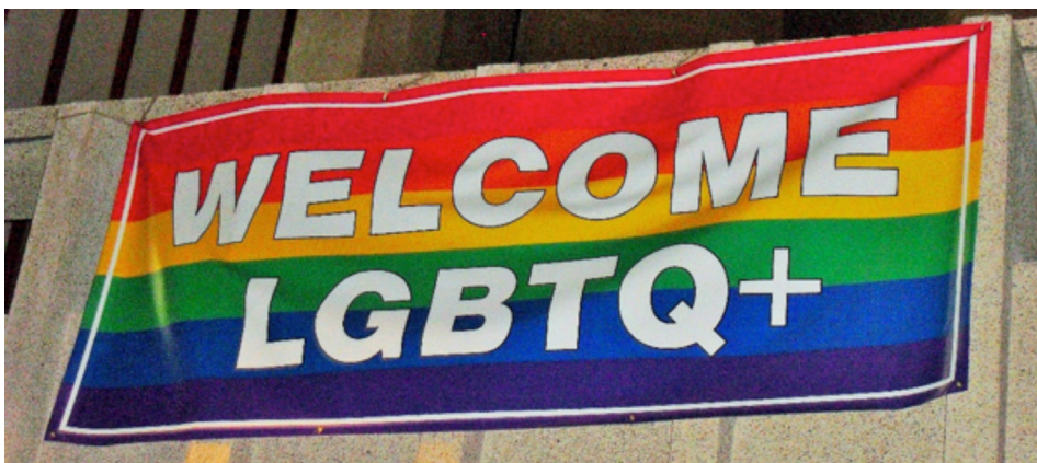
A large banner on the back wall inside St. Matthew Church welcomes lesbian, gay, bisexual, transgender and questioning people.