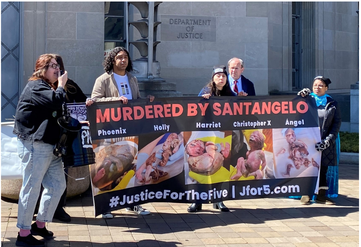
Justice for the Five at DOJ

On Thursday March 30, three pro-life activists were assaulted by violent pro-abortion people as they gave witness outside of Columbia Heights Education Campus, a DC public school located at 3101 16th Street NW in Washington DC.