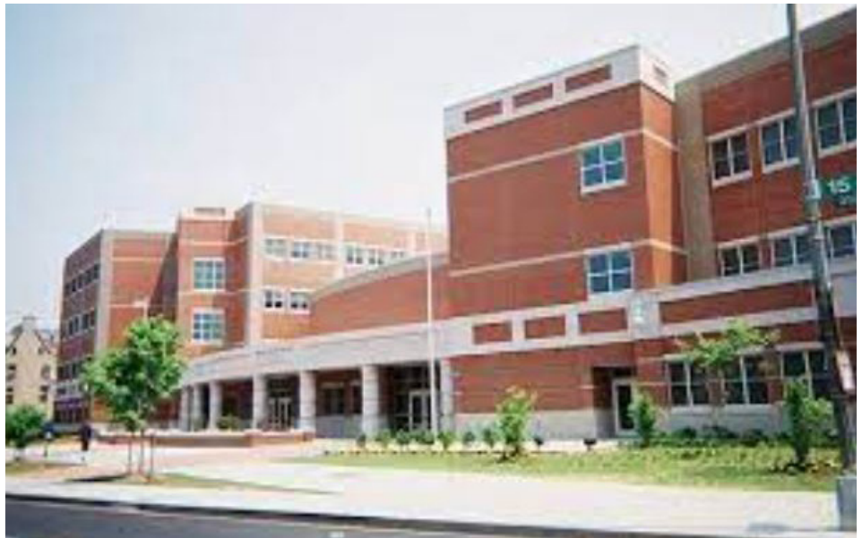
Columbia Heights Educational Campus

“Today in DC three of us showed up outside Columbia Heights Education Campus (a high school) to show the Justice for the Five banner I'd borrowed from PAAU and pass out flyers asking people to sign the Jfor5 petition. Everything went fine and students were horrified by abortion (as they usually are), until a few vehement pro-abortion adults got the teenagers angry at us instead. One wicked young woman snatched the microphone out of XXX's hands and destroyed it, and then she and her friend attempted to break our sign. Before you knew it the whole mob came at us violently and soon both XXX and myself were on the ground getting kicked and punched. I lost my phone and broke my glasses in the process.