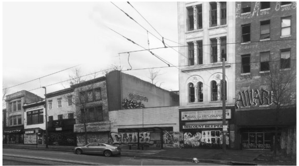
Planned Parenthood squalor at Howard Street

Even if one ignores morality, common sense should tell everyone that a species that kills its offspring will not survive. Society needs strong families to flourish, so this legislature should be