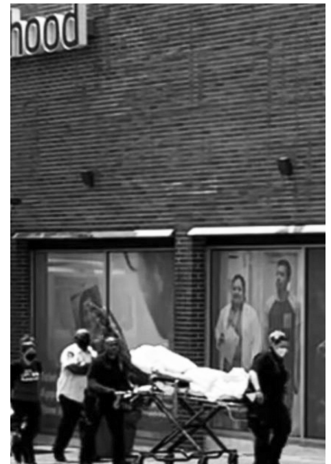
Planned Parenthood botched abortion