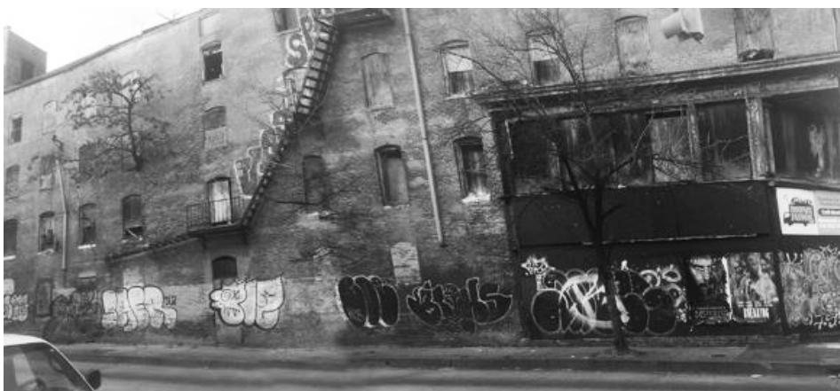
Planned Parenthood squalor at Mulberry Street