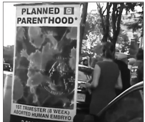
Showing the truth of abortion to unaware public