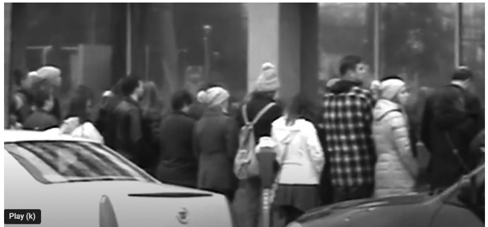
Praying Rosary at a Planned Parenthood

Rescues and sidewalk counseling are, by definition, “last-ditch” measures. As the saying goes, an ounce of prevention is worth a ton of cure. Abortion, heinous as it is, is one of many manifestations of an ungodly culture. Thus we need activists who will educate the public regarding the nature of abortion. I have several friends who have gone to local community colleges on a regular basis to educate young people about the horror of abortion. Many of these young people had been brainwashed by the public education system that is infested with