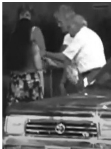
Sidewalk counselor offering life-affirming help