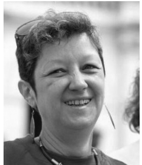
Norma McCorvey, Jane Roe of Roe v Wade

She claims to have had two abortions before her own religious conversion in 1983. She has described abortion as "womb lynching" and accusing Planned Parenthood of profiting from "aborted black ba-