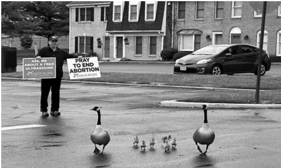
Geese family – God can use you, too!