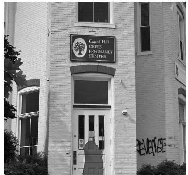
Capitol Hill Pregnancy Center, vandalized by pro-aborts

Let’s start with activities such as Red Rose Rescues or the older type of rescues that were often done in the 1990s. When they happened, abortuaries were closed and babies saved. However, pro life activists were also jailed. Perhaps that jailing served other purposes, but it also meant that while they were jailed, they could not be actively in the fight. The FACE act was then passed, giving some pro lifers “cause for pause”. Some might opine that the activists got cold feet. I’m more inclined that the activists had to weigh not only personal costs, but also detrimental effects to their own familial responsibilities – responsibilities that, under God’s law and natural law, take precedence over any others. As it was, the 1990s rescues did much to serve notice on the nation that some found