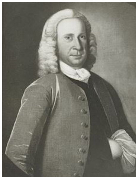
Matthew Tilghman led the drafting of the MD Constitution

in that effort know that our failure was quite spectacular. If we are honest, we know that we made many serious blunders. I will summarize them now in the hopes that we have learned some things and won’t repeat those blunders.